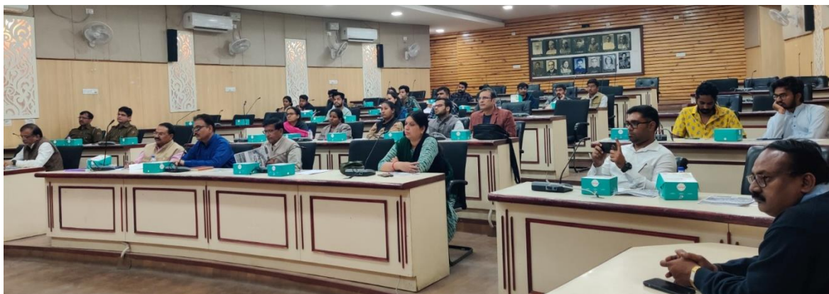
Participants during the 2 nd Capacity Building Workshop