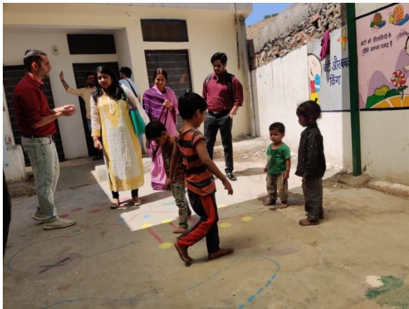
UDI Expert PMU explaining about the semi-permanent project implemented at AWC Manoharpura