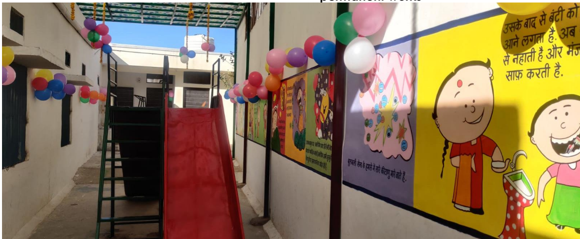
Activity Zone developed in the back corridor of the School with installation of slides, paintings/story on walls and installations of the shading elements, segregating spaces for the young children of the AWC