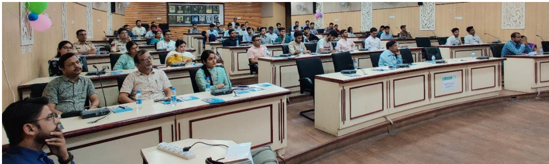
Participants during the 3 rd Capacity Building Workshop

The 3 rd CBW under the Urban95 Phase-II was organized on Tuesday, 2 nd May 2023 at Board Meeting Room, Udaipur Municipal Corporation (UMC), with the attendance of approx. 85 participants (mix of in- person- 62 nos. & virtually on Zoom Platform- 21 nos.), a good mix of government and non- government officials/ personnel (Private Sector, NGOs, Colleges, University etc.). The workshop was scheduled for 1.5 hours (from noon to 1:30 PM), it ended up being an interactive and interesting session with a live Q&A session. Online participants also expressed their appreciation for the workshop's content and for the clarity it provided regarding the tendering process, which is the most crucial step in deciding whether to move forward with a project's on-the-ground implementation and Operation and Maintenance (O&M) after it has been completed. From M&E perspective, participants feedback were captured from the perspective of attaining information about their expectations and experiences of 3 rd CBW.