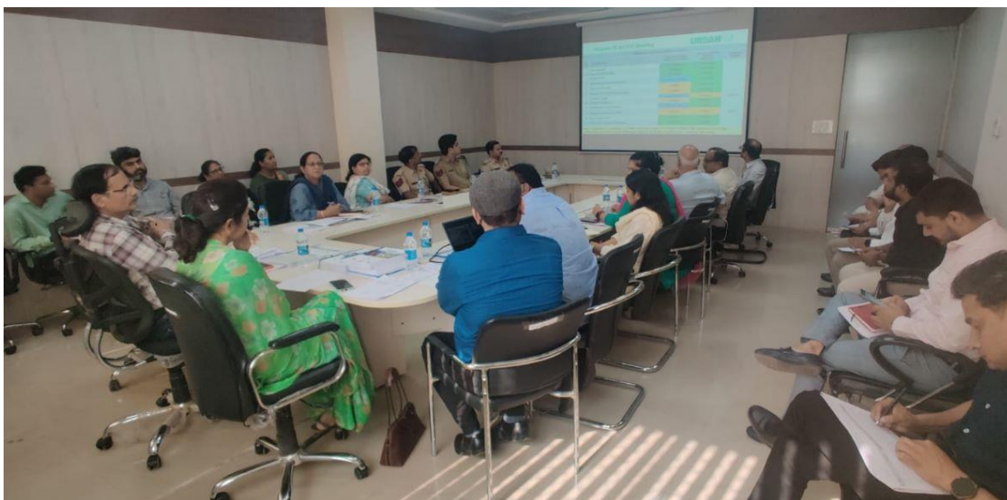
Officials participating in the 3 rd PSC Meeting

The 3 rd Urban95 Udaipur Phase-II Project Steering Committee (PSC) meeting was organized by UMC in their Mini Meeting hall on 5 th July '23 at 4:00 pm. The objective of this meeting was to review the Urban95 program progress and to provide approvals and suggestions on the various project documents and activities presented by the Programme Management Unit (PMU) comprises of ICLEI-SA & Ecorys and Parents+ comprises of Jatan Santhan with the support of Program Management Support Unit (PMSU) under the Urban95 Udaipur Phase-II Program.