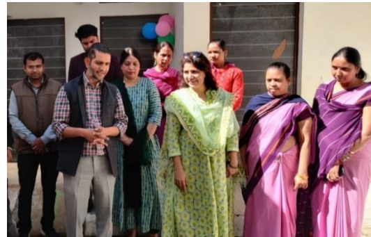
PMU team members explaining the various elements and component used in the semi-permanent works