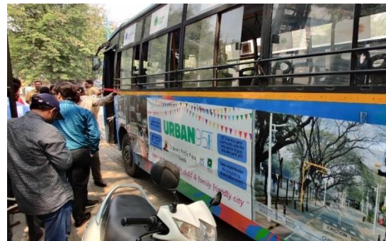
Promotion of the Urban95 Kids Festival at Pune in the buses