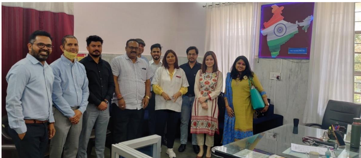
BvLF team visiting the semi-permanent project implemented at PHC Sec-11 (joined by PMU & PMSU teams)