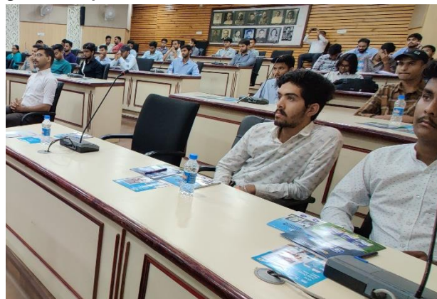
Participants during the 3 rd Capacity Building Workshop