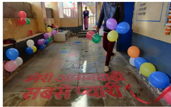
Inauguration of the Semi-permanent works at the AWC Manoharpura, Badgaon