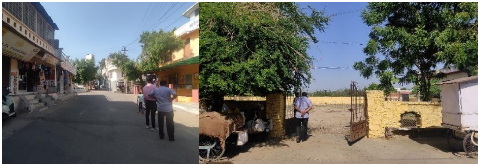
PMU team visiting the Neemuch Kheda site

On 7 th June'23 a site visit was conducted to CPZ Neemuch Kheda to take measurements and to discuss the design concepts with the local ward councilor. Interactions with the local community was also done with respect to spread awareness about the project and the semi-permanent project to be implemented.