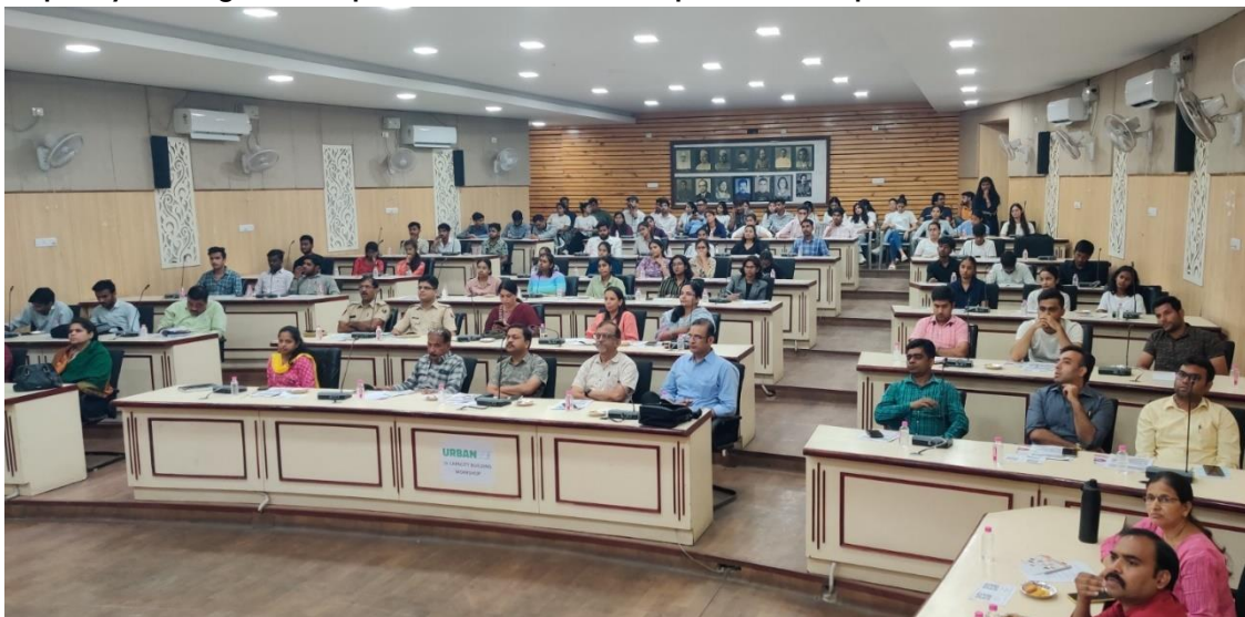
Participants during the 4th Capacity Building Workshop