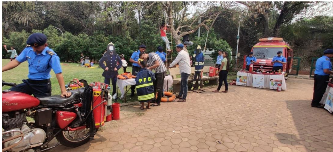
Stall from the Pune Municipal Corporation on Fire Safety and Disaster Management