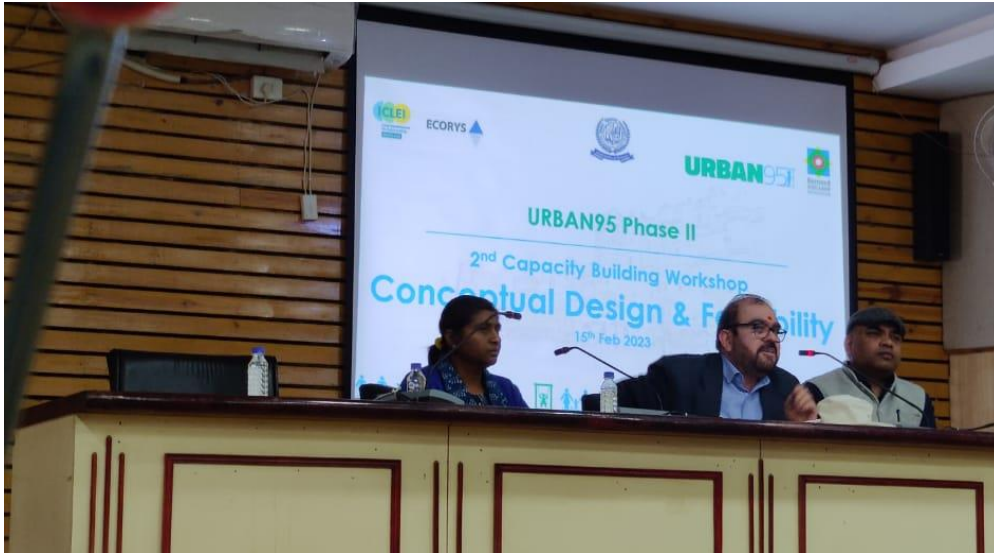
Deputy Commissioner UMC, Superintending Engineer UMC & USCL and Program Manager Urban955 Program welcoming the participants during the 2nd CBW

Including Community Engagement' in detail along with analysis of the collected data and using the same while conceptualizing the design proposal.