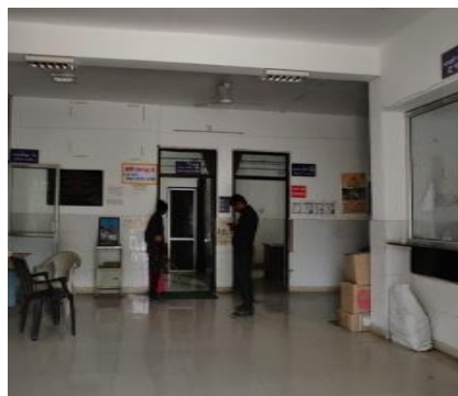
Site visit to the PHC Madri and PMU team members discussing on the present facilities with the PHC staff (top row 2nd picture)