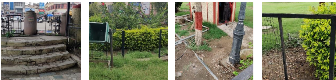
Issues identified during the site visit to the Town Hall Park

ECD Expert and TL, PMU visited the Town Hall Park on 21 st June'23 for assessing the same as potential location for organizing the 2 nd Udaipur Urban95 Kids Festival targeted to be organized in August'23. The issues related with the site were also identified and a draft presentation ((assessment of barriers, motivators, site maintenance perspectives)) related with organizing the 2 nd Udaipur Urban05 Kids Festival was shared with PMSU on 27 th June'23.