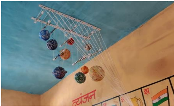
Installation of the Solar system in the AWC room (via Pulley system)