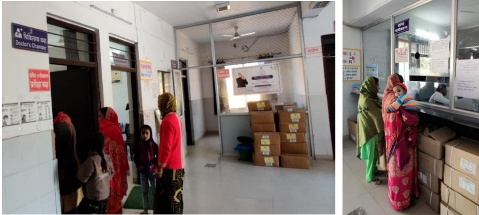
Site visit to the PHC Madri to see the potential in terms of infrastructure, footfall, available medical facilities, staff etc.