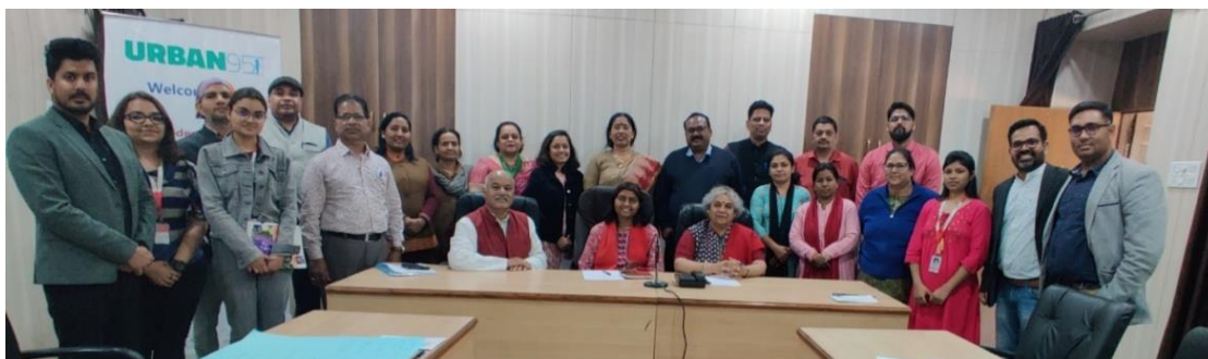
Participants during the Stakeholder Engagement Workshop